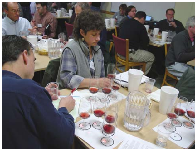
Thursday sessions were devoted to a trade show (Left) and special small group tasting (right) at the new Vinification and Brewing Laboratory at the Geneva Experiment Station.