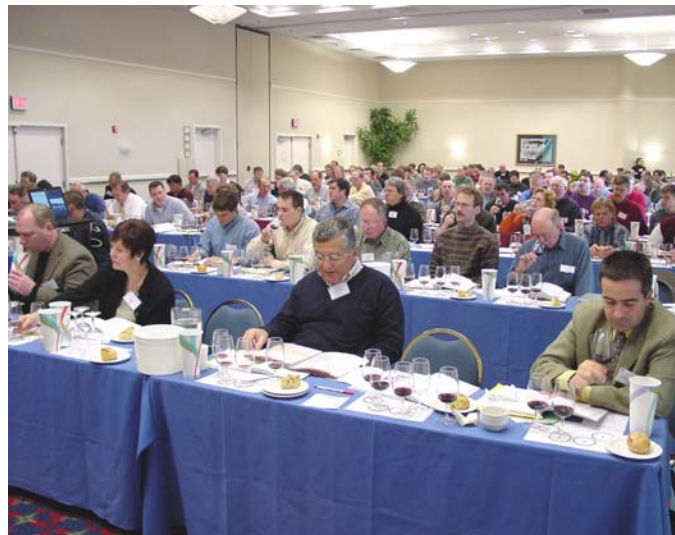
Program session at the Ramada Inn in Geneva.